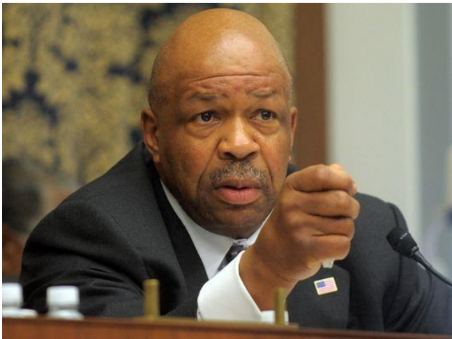
Chairman Elijah Cummings (D-GA)

“For years, drug companies have been aggressively increasing prices on existing drugs and setting higher launch prices for new drugs while recording windfall profits. The goals of this investigation are to determine why drug companies are increasing prices so dramatically, how drug companies are using the proceeds, and what steps can be taken to reduce prescription drug prices.” –Rep. Elijah Cummings