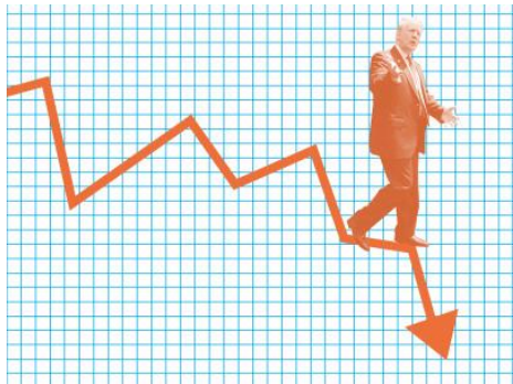
Opinion of Trump has changed since the shutdown Trump's approval and disapproval ratings since taking office