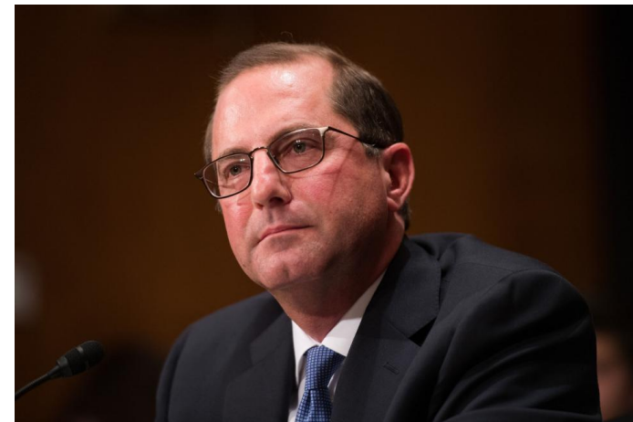
Secretary of HHS Alex Azar